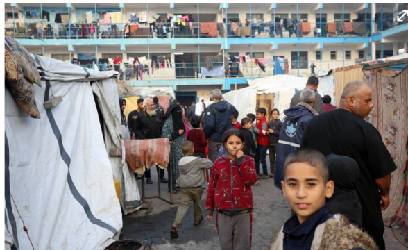
Displaced children in an UNRWA school-turned-shelter, 2023