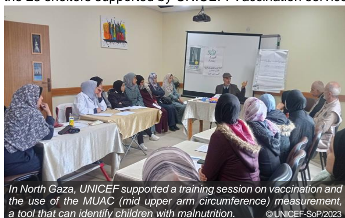
In North Gaza, UNICEF supported a training session on vaccination and the use of the MUAC (mid upper arm circumference) measurement, a tool that can identify children with malnutrition.

UNICEF with partners trained 25 health service providers in North Gaza governorate, to deliver vaccination services at the 23 shelters supported by UNICEF. Vaccination services resumed on Saturday, 13 January, reaching 2577 children with vaccines through mobile teams and fixed centres in North Gaza through a local partner with UNICEF support. Also, UNICEF continued to support catch-up immunization activities in the south of the Gaza Strip, supporting the Palestinian Ministry of Health (MOH) and UNRWA to reach new-born children who had missed on the vaccine schedule. A total of 11,314 children 2 were reached with eight different vaccines per the national routine Expanded Programme of Immunization (EPI).