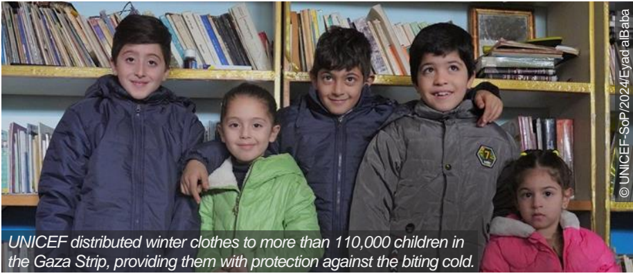
UNICEF distributed winter clothes to more than 110,000 children in the Gaza Strip, providing them with protection against the biting cold.