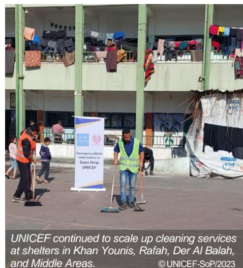
UNICEF continued to scale up cleaning services at shelters in Khan Younis, Rafah, Der Al Balah, and Middle Areas.