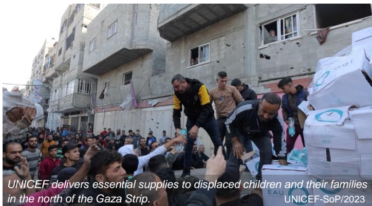
UNICEF delivers essential supplies to displaced children and their families in the north of the Gaza Strip.

The resumption of the hostilities, coupled with a lack of power supply, fuel shortages, restricted access, and infrastructure damage, have significantly impeded the availability and access of water supply, sanitation, and hygiene services to the affected population in the Gaza Strip. In response to the urgent WASH humanitarian needs, during the reporting period, UNICEF provided 660,000 litres of life-saving bottled water distributed to non-UNRWA schools, hospitals, and host communities in Deir Balah, Khan Younis, Rafah, and in the north of Gaza, benefitting a total of over 220,000 people, including over 110,000 children. Out of the stated amount, 264,000 litres were distributed in the north of Gaza. Moreover, the UN provided over 118,000 litres of fuel to operate more than 66 public and private water wells, desalination plants, and water trucking, reaching more than 1 million people, including over 560,000 children with clean water for drinking and domestic needs in Deir Al Balah, Khan Younis, Rafah and parts of North Gaza.