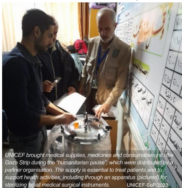
UNICEF brought medical supplies, medicines and consumables into the Gaza Strip during the "humanitarian pause", which were distributed by a partner organisation. The supply is essential to treat patients and to support health activities, including through an apparatus (pictured) for sterilizing small medical surgical instruments. UNICEF-SoP/2023

In response to the deteriorating environmental and sanitary conditions, the UN provided fuel to one wastewater treatment plant to support sewage treatment and safe disposal, benefitting over 275,000 people, including over 140,000 children in Rafah. In addition, to addressing solid waste, UNICEF continued to support cleaning services in the Khan Younis Training Centre, benefitting over 24,000 people, including 12,500 children. In partnership with WASH actors, UNICEF is scaling up WASH service delivery in IDP hosting communities through an integrated package of WASH services.