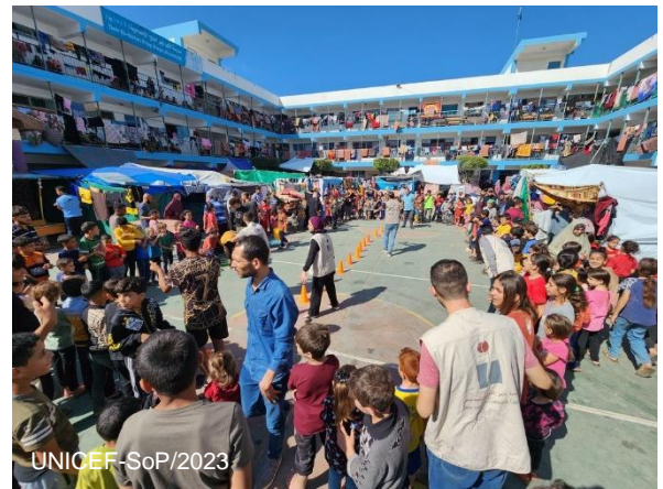
Pictured (two photos): UNICEF-supported recreational activities for displaced children in an UNRWA school turned into a shelter in Deir Al Balah.