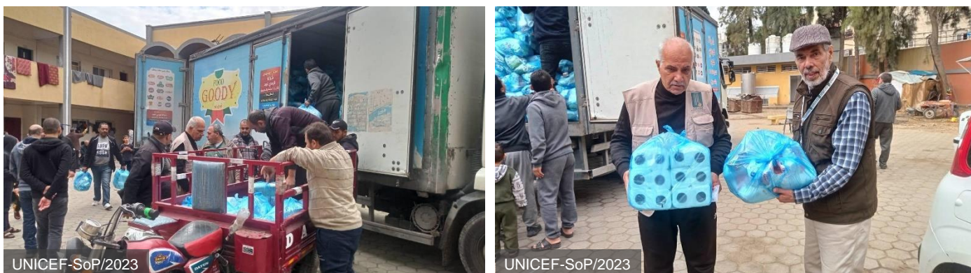
Pictured (two photos): 10,000 hygiene kits procured locally by UNICEF are being delivered in North Gaza for distribution in 13 shelters in Jabalia.

The WASH Cluster is operating two coordination working groups in the Gaza Strip and the West Bank. In the Gaza Strip, 17 partners are active with a mixed level of operational capacity, mainly concentrated in Rafah, Khan Younis and Deir el Balah. The main activities include distribution of hygiene kits, bottled water and water trucking. Access and achievements in the North of Wadi Gaza remains severely restricted. The WASH cluster has initiated a Gaza Operation Cell to coordinate fuel and water production/distribution issues. The WASH sector is receiving only 19,520 litre of fuel per day which is not sufficient to ensure the public health of the population across Gaza, with risks related to insufficient safe drinking water per person and the non-treatment of sewage.