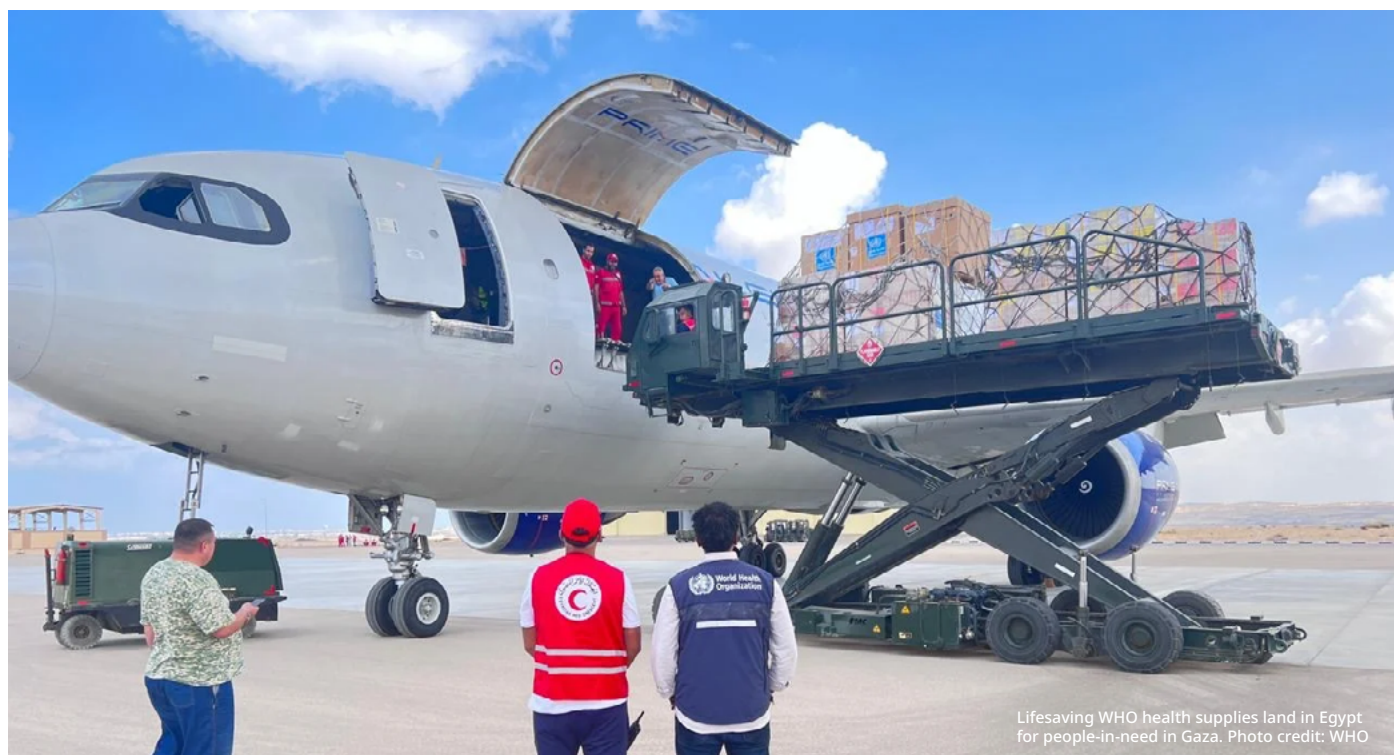
Lifesaving WHO health supplies land in Egypt for people-in-need in Gaza.