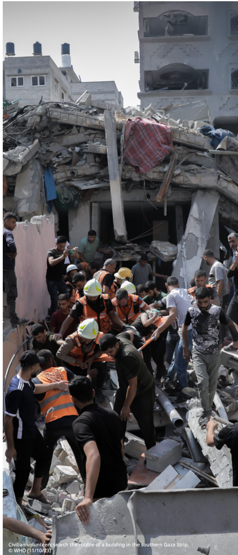
Civilian volunteers search the rubble of a building in the southern Gaza Strip, © WHO (11/10/23)

The escalation of hostilities in oPt and Israel carries the risk of direct or indirect consequences including violent protests, civilian casualties, injuries, damage to health facilities, and displacement in Jordan, the Islamic Republic of Iran and Iraq. The Jordanian government has confirmed that they cannot accept refugees, but such a contingency cannot be fully discounted.