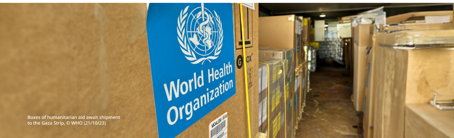
Boxes of humanitarian aid await shipment to the Gaza Strip, (21/10/23)