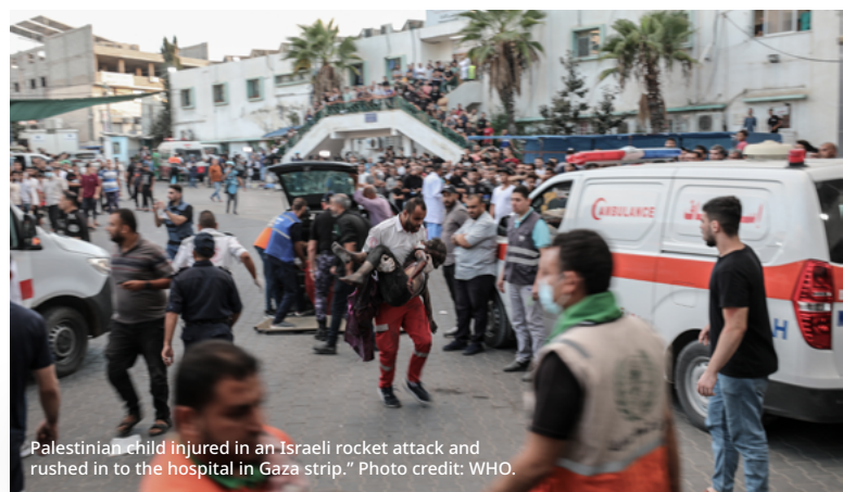
Palestinian child injured in an Israeli rocket attack and rushed in to the hospital in Gaza strip."

Since the escalation of the hostilities, the number of internally displaced people (IDPs) has reached over 1.4 million (>60% of Gaza's population), with 590 000 IDPs staying in UNRWA-designated emergency shelters (DES) in increasingly dire conditions. Fuel reserves in hospitals are critically low. 67% of primary care clinics and 35% of hospitals are non-functional. Essential medical equipment including life support machines are dependent on hospital electricity generators. UNRWA's DES are overcrowded, forcing many displaced people to sleep outdoors. There is an imminent risk of communicable disease outbreaks. Essential resources like water, food, and medicine are in critically short supply, leading to rising frustration and tensions among displaced populations. There are increasing risks of dehydration, hunger, water-borne diseases, and skin infections. There is also a risk of shutdown of electricity-dependent basic services, which would further aggravate the already dire situation.